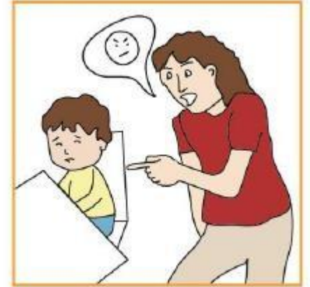
Harm to Your Heart or Mind