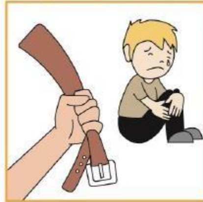
Harm to Your Body that Makes You Feel Pain