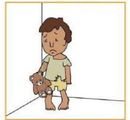
Carers Not Taking Care of You